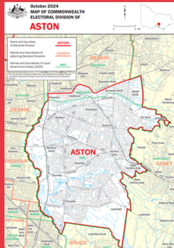
This map shows the new boundaries for the Aston electorate. The new boundaries to be applicable at the election.

The Australian Electoral Commission (AEC) announced the final Federal electoral boundaries for Victoria.