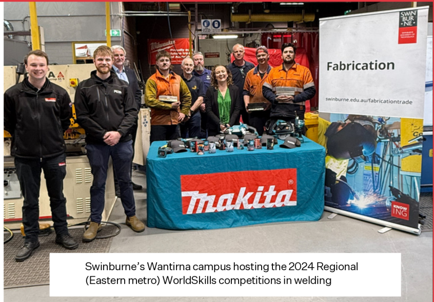
Swinburne's Wantirna campus hosting the 2024 Regional (Eastern metro) WorldSkills competitions in welding

More than 3 million Australians will benefit from our student debt relief, including many in our community.