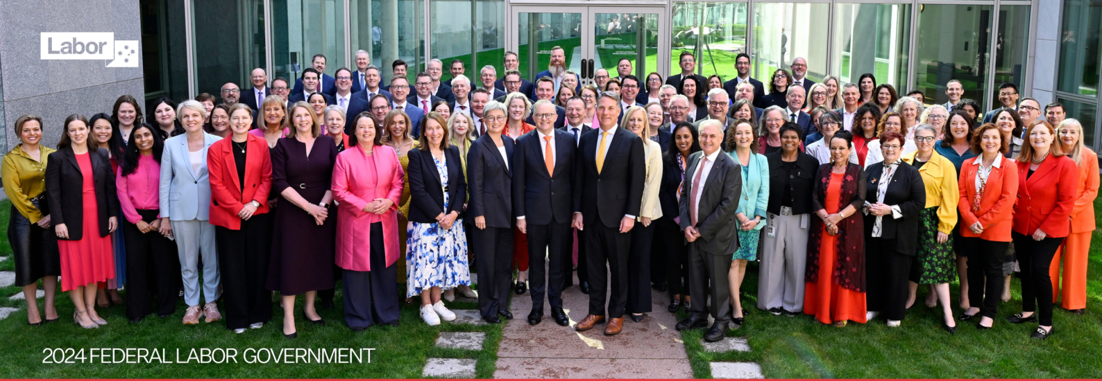
2024 FEDERAL LABOR GOVERNMENT