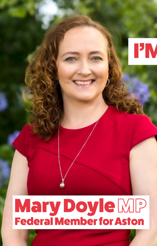
Mary Doyle MP Federal Member for Aston