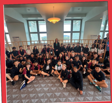
The Knox School visit to the Australian Parliament House