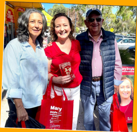
Weekend mobile office at Wantirna Mall