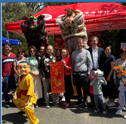
Lunar New Year with the Chinese Association of Victoria