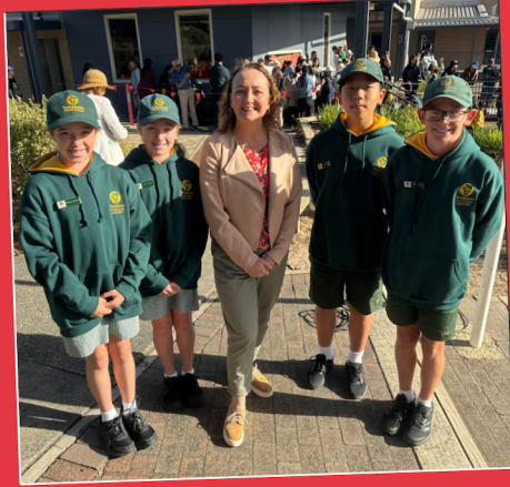
Assembly at Templeton Primary with the School Captains