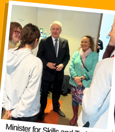
Minister for Skills and Training The Hon Brendan O'Connor MP at Swinburne - Wantima Campus