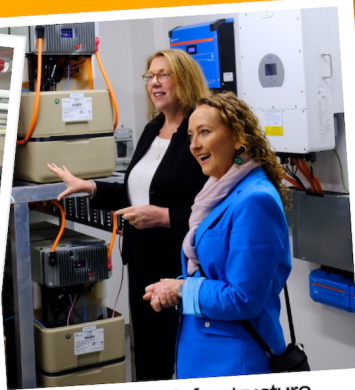
Minister for Infrastructure, Transport, Regional Development and Local Government The Hon. Catherine King MP at Fairpark Reserve