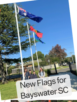
New Flags for Bayswater SC