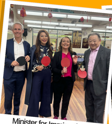
Minister for Immigration, Citizenship and Multicultural Affairs The Hon. Andrew Giles MP at Chinese Association of Victoria