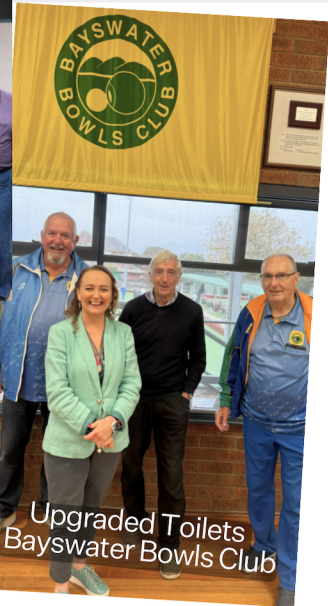
Upgraded Toilets Bayswater Bowls Club