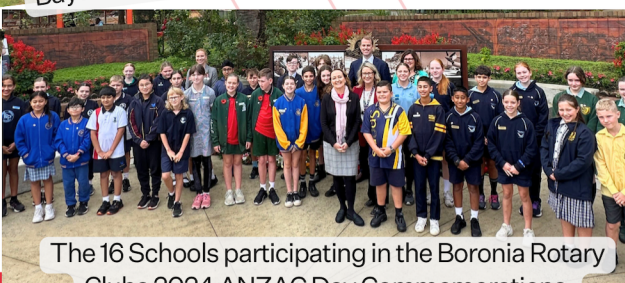
The 16 Schools participating in the Boronia Rotary Clubs 2024 ANZAC Day Commemorations