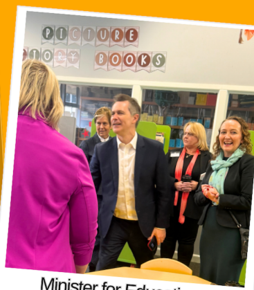
Minister for Education The Hon. Jason Clare MP at Wantirna South PS Principals' Roundtable