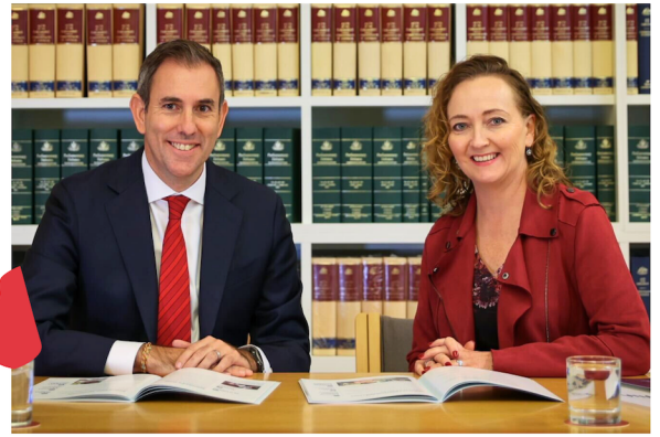
Federal Treasurer, Dr Jim Chalmers MP and myself in Parliament recently going over the 2024/25 Federal Budget.

We're also making sure that student debt never grows faster than someone's wages or ability to pay it off. Last year's indexation spike wasn't fair; under our changes, it won't ever happen again.