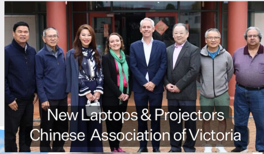
New Laptops & Projectors Chinese Association of Victoria

This much needed funding helped upgrade facilities and purchase equipment, helping clubs thrive in the local Aston community.