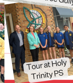
Tour at Holy Trinity PS