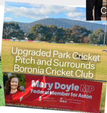
Upgraded Park Cricket Pitch and Surrounds Boronia Cricket Club