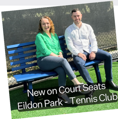
New on Court Seats Eildon Park - Tennis Club