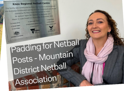
Padding for Netball Posts - Mountain District Netball Association