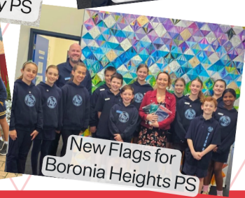
New Flags for Boronia Heights PS