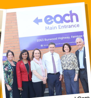
Minister for Health and Aged Care The Hon. Mark Butler MP at EACH in Ferntree Gully