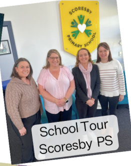
School Tour Scoresby PS