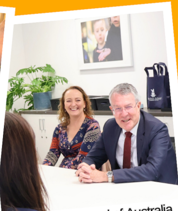
Attorney-General of Australia Hon Mark Dreyfus KC, MP at The Knox School