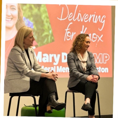
Minister for Finance, for Women, and for the Public Service The Hon. Katy Gallagher MP at Swinburne - Wantima Campus