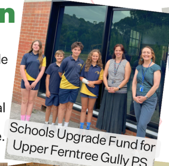
Schools Upgrade Fund for Upper Ferntree Gully PS