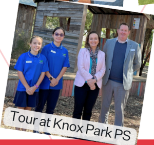
Tour at Knox Park PS