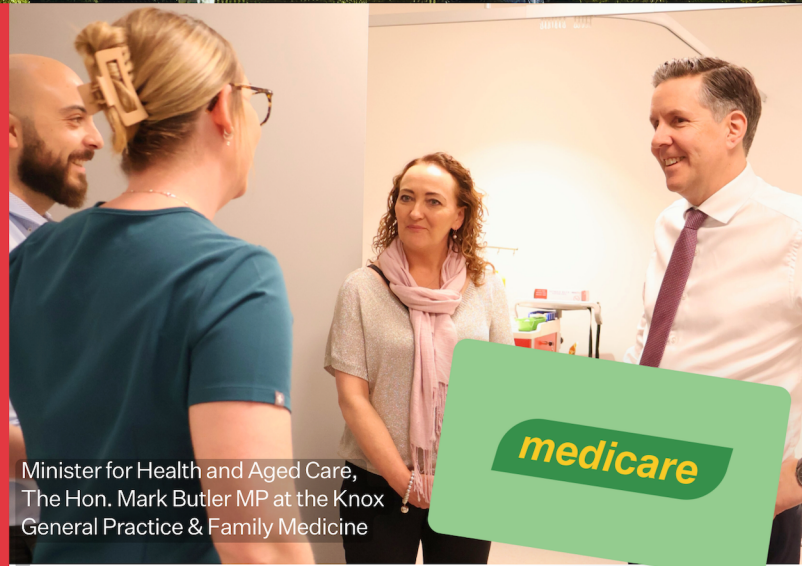
Minister for Health and Aged Care, The Hon. Mark Butler MP at the Knox General Practice & Family Medicine