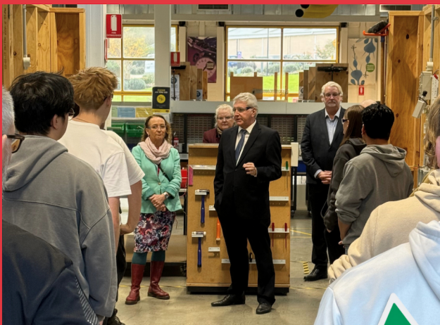
Minister for Skills and Training, The Hon. Brendan O'Connor MP talking with electrical apprentices at Swinburne TAFE Wantirna Campus

All of this will help to build a highly skilled workforce in Aston and create secure jobs with fair wages.